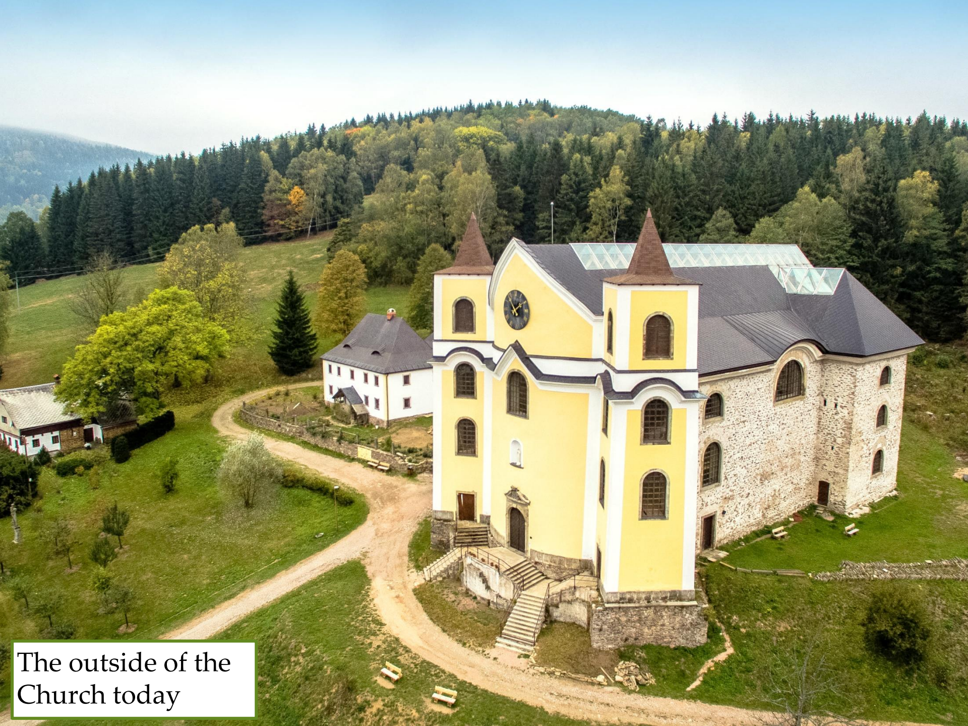
The outside of the Church today