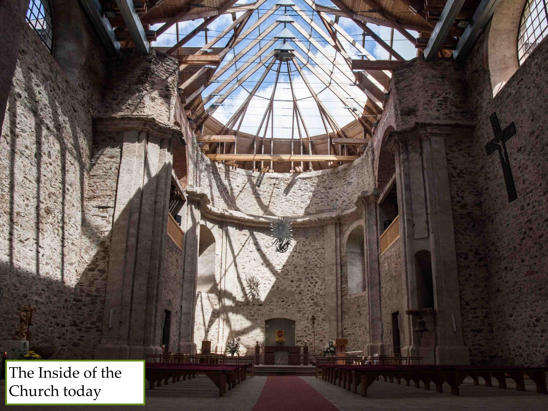
The Inside of the Church today